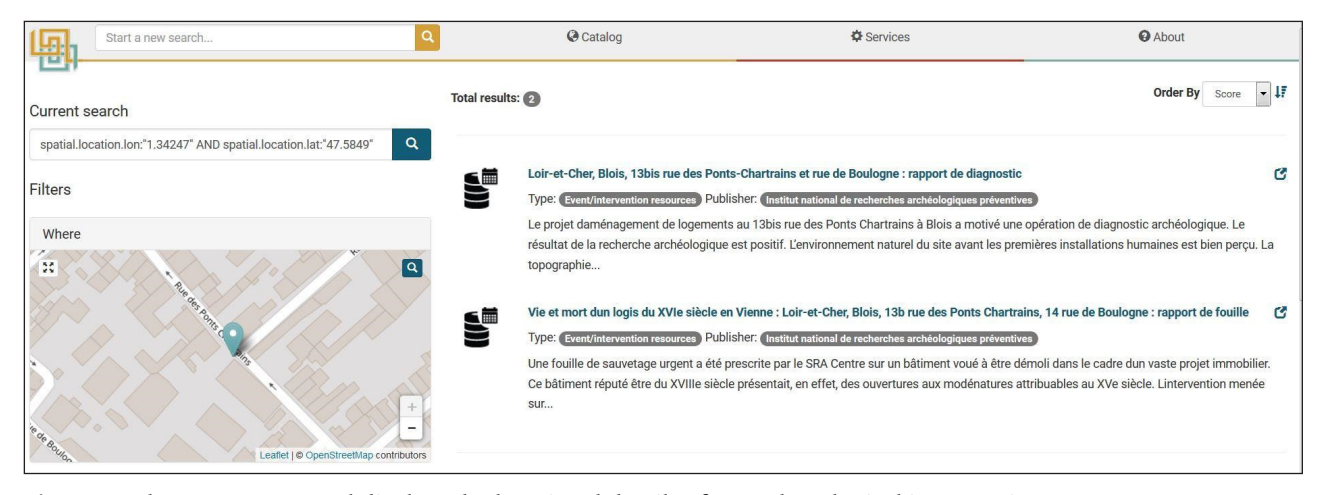
Figure 2: The ARIADNE portal displays the locational details of an archaeological intervention.

the ARIADNE Infrastructure project (ARIADNE 2019a) pooled existing archaeological research data infrastructures through new and powerful technologies to provide a European-wide interoperable dataset. Spatial data is limited to location based searching rather than rendering the spatial footprint of the asset. The portal displays the location of records in the system. Figure 2 shows the location of an excavation undertaken by INRAP in Blois, France. Users can read a summary of the project on the portal (ARIADNE 2019b) or follow a hyperlink through to the contributing organisation's own resource (INRAP 2019). However, INRAP also maps the spatial footprint of excavations and the features revealed ( Figure 3 ). Rich attribution allows